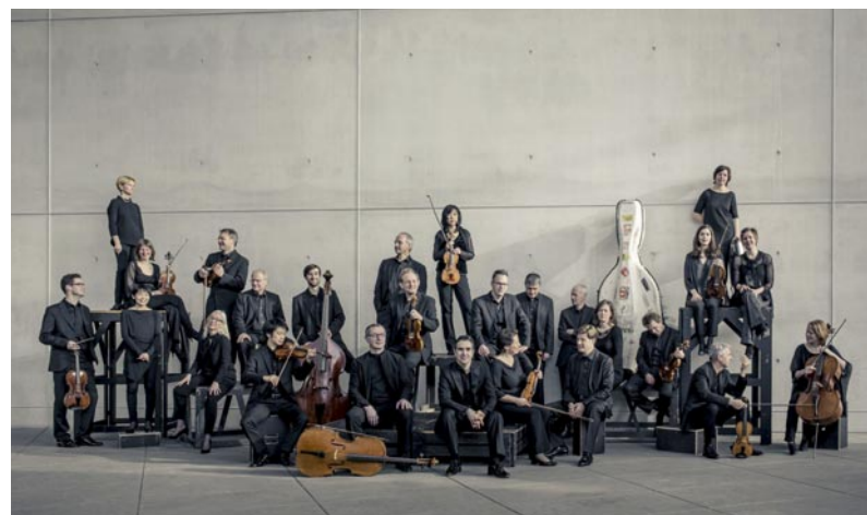
Munich Chamber Orchestra